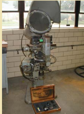
J & L Comparator