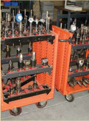
CNC Tool Holder