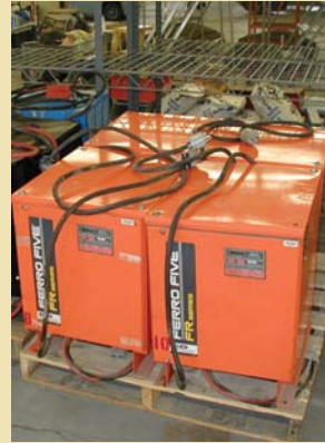
Miller Syncrowave 350