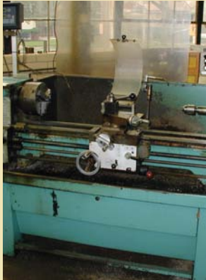
Harrison 13 x 45 Lathe