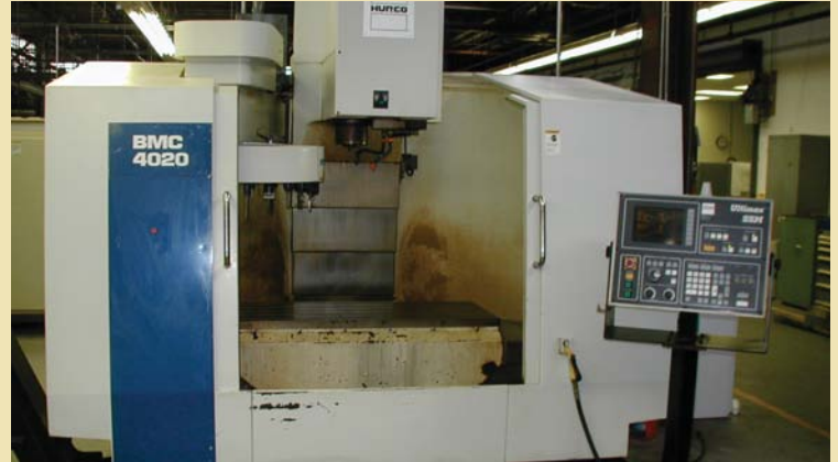
Hurco CNC VMC