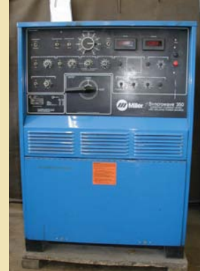
Miller Syncrowave 350 -2