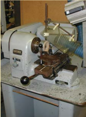
Hardinge Speed Lathe