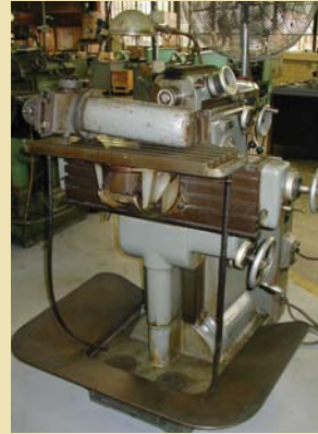
Deckel FP-2 Mill