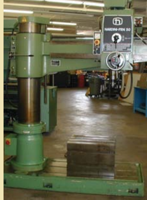
Nardini Radial Arm Drill