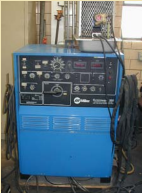
Miller Syncrowave 350