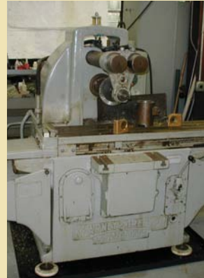
K & T 1236 Mill