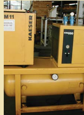
Kaeser Air Compressor

Metal Muncher Model MM35 Hydraulic Iron Worker: s/n CH183362; capacity 1" rounds, 1" square, 3" x 3" x 5/16" angles, 3/16" x 18" - 3/4" x 6" flats