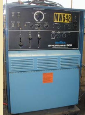
Miller Syncrowave 300