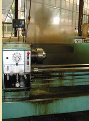
Harrison 16 x 66 Lathe