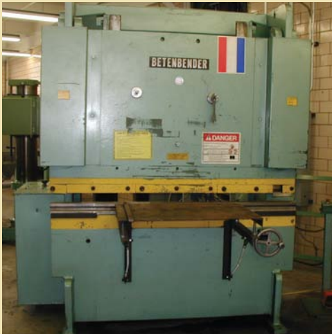
Betebender Press Brake

WEDNESDAY SEPT. 12TH, 2007 AT 9:00 A.M. LOCAL TIME