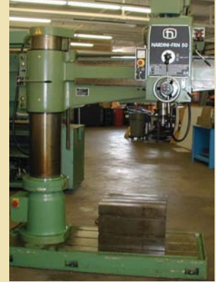
Nardini Radial Arm Drill