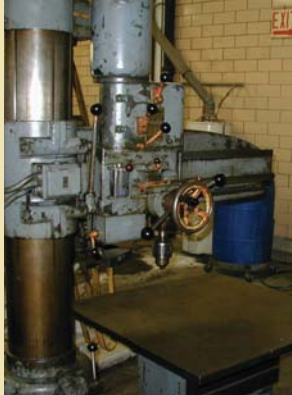
Arboga Radial Drill