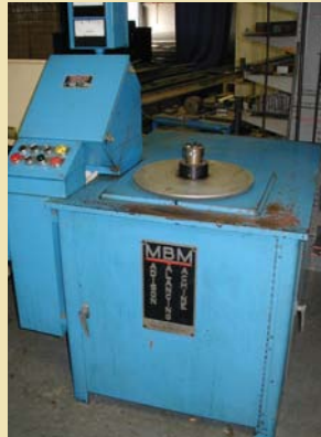
MBM Balancing Machine