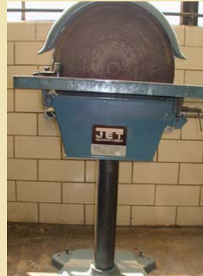
Jet Disk Sander