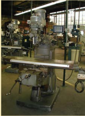
Bridgeport Series II