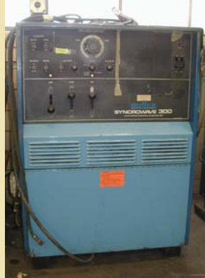
Miller Syncrowave 300 -2